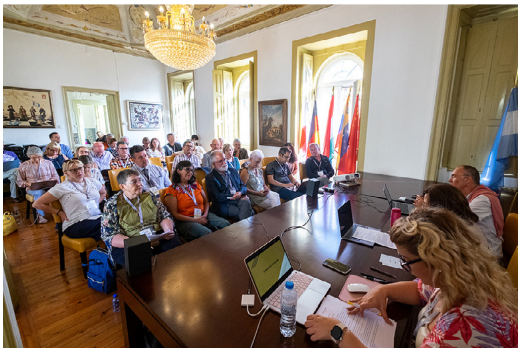
IFCM 2022 General Assembly at the Palacete dos Condes de Monte Real

After a successful online voting which resulted in multiple changes in the IFCM Bylaws and Membership Policy document*, more than 50 IFCM members attended the 2022 General Assembly (4 September 2022) at Palacete dos Condes de Monte Real (Lisbon, Portugal) where they had the possibility to listen to reports on IFCM's projects and activities, ask questions, and make suggestions.