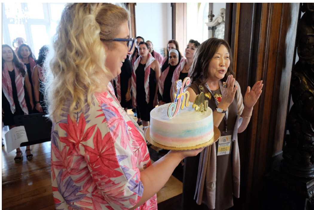
Happy Birthday IFCM!