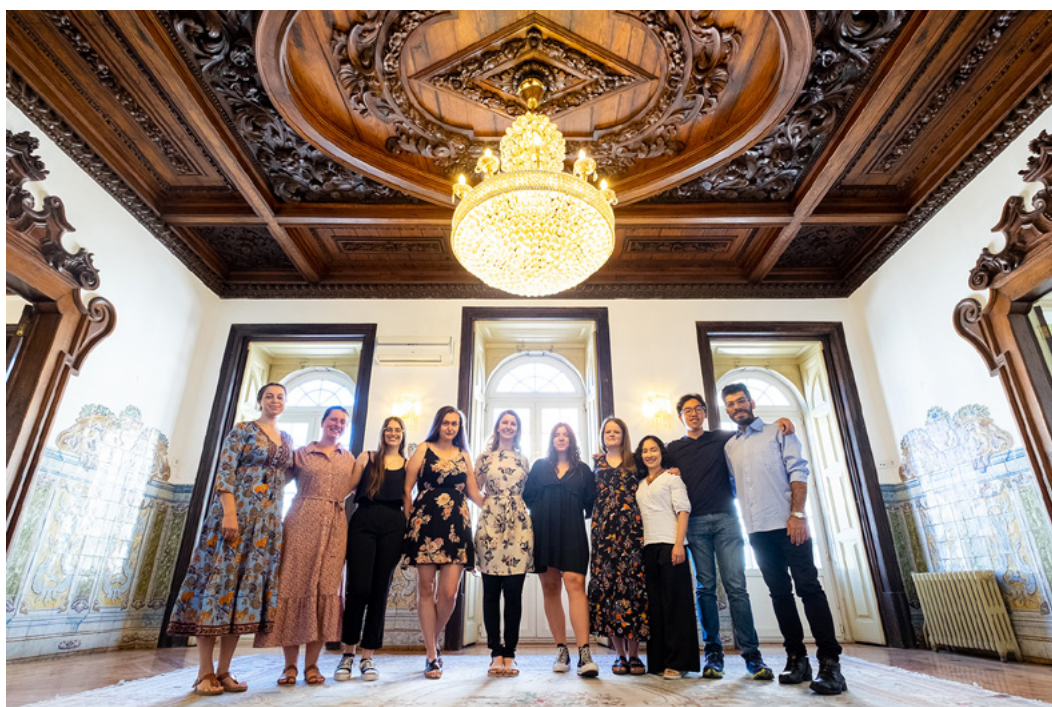
YOUNG participants at the Palacete dos Condes de Monte Real