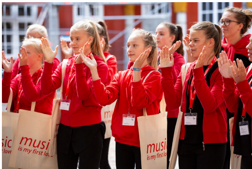
Eurotreff 2019