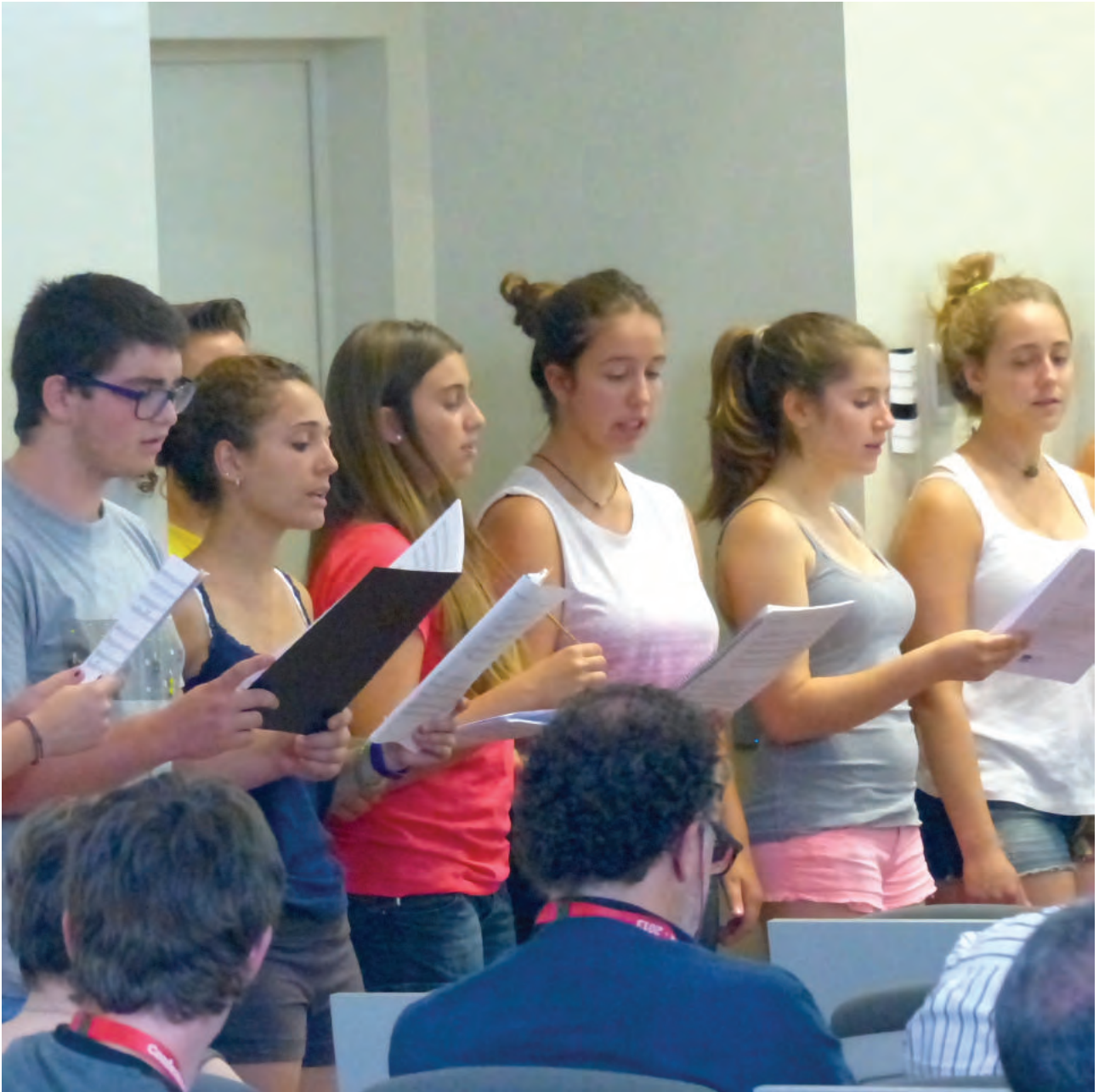
Mediterranean Voices Conference, 2013, Girona, Spain