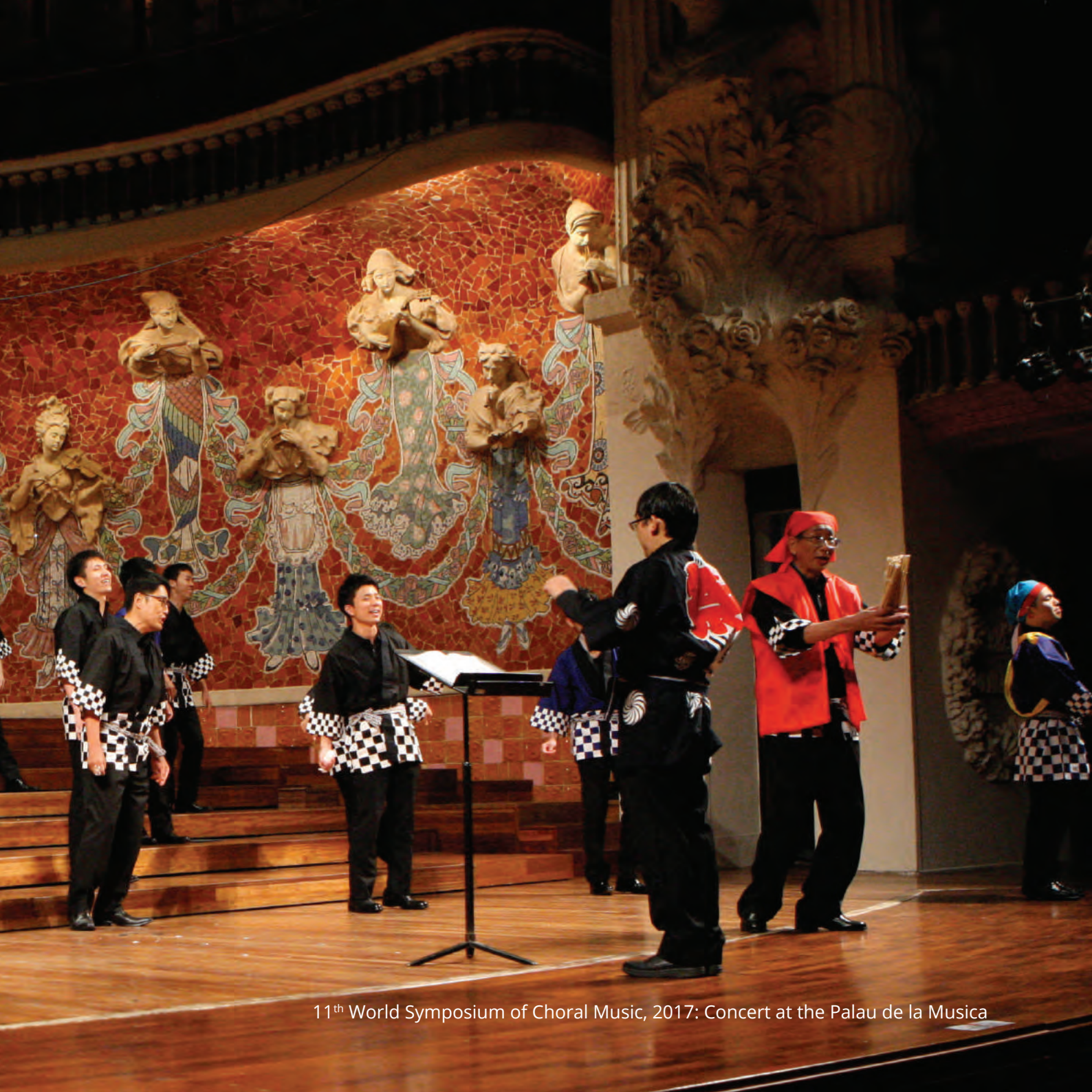
11 th World Symposium of Choral Music, 2017: Concert at the Palau de la Musica