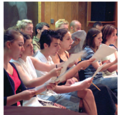
World Youth Choir, Chicago 2002