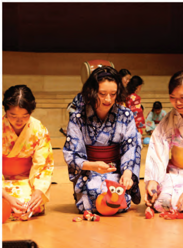
11 th World Symposium of Choral Music, 2017, Barcelona, Spain