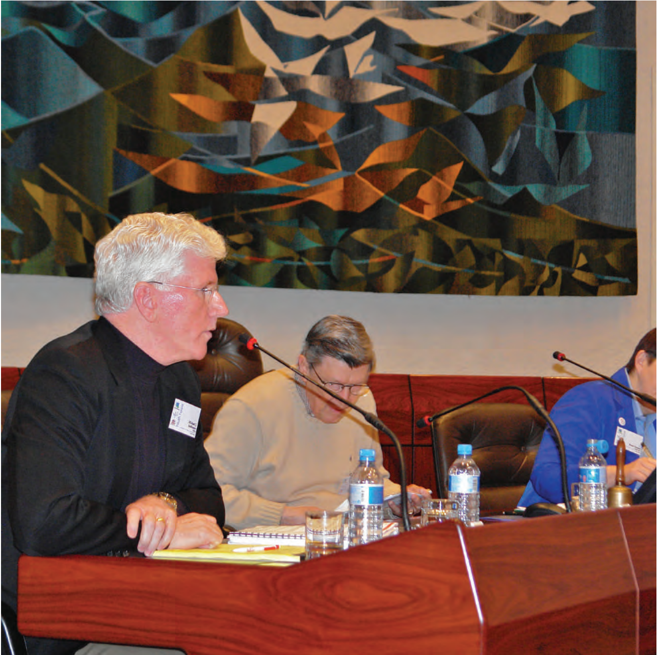
1 st International Forum 'Voice, Youth and Arts Management', 2008, Caen (France)