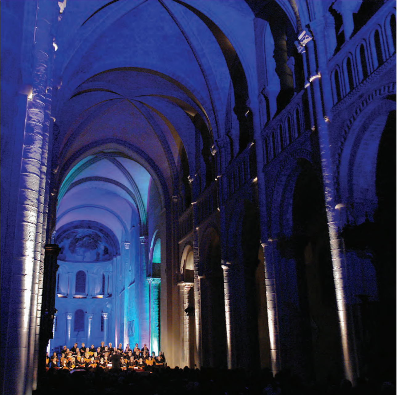
1 st International Forum 'Voice, Youth and Arts Management', 2008, Caen (France)