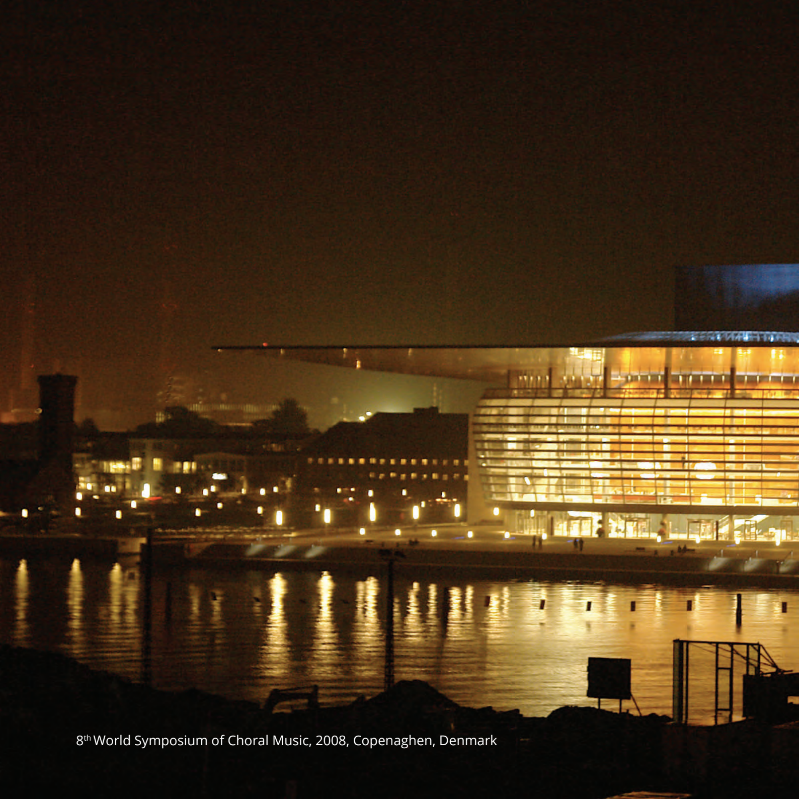
8 th World Symposium of Choral Music, 2008, Copenhagen, Denmark