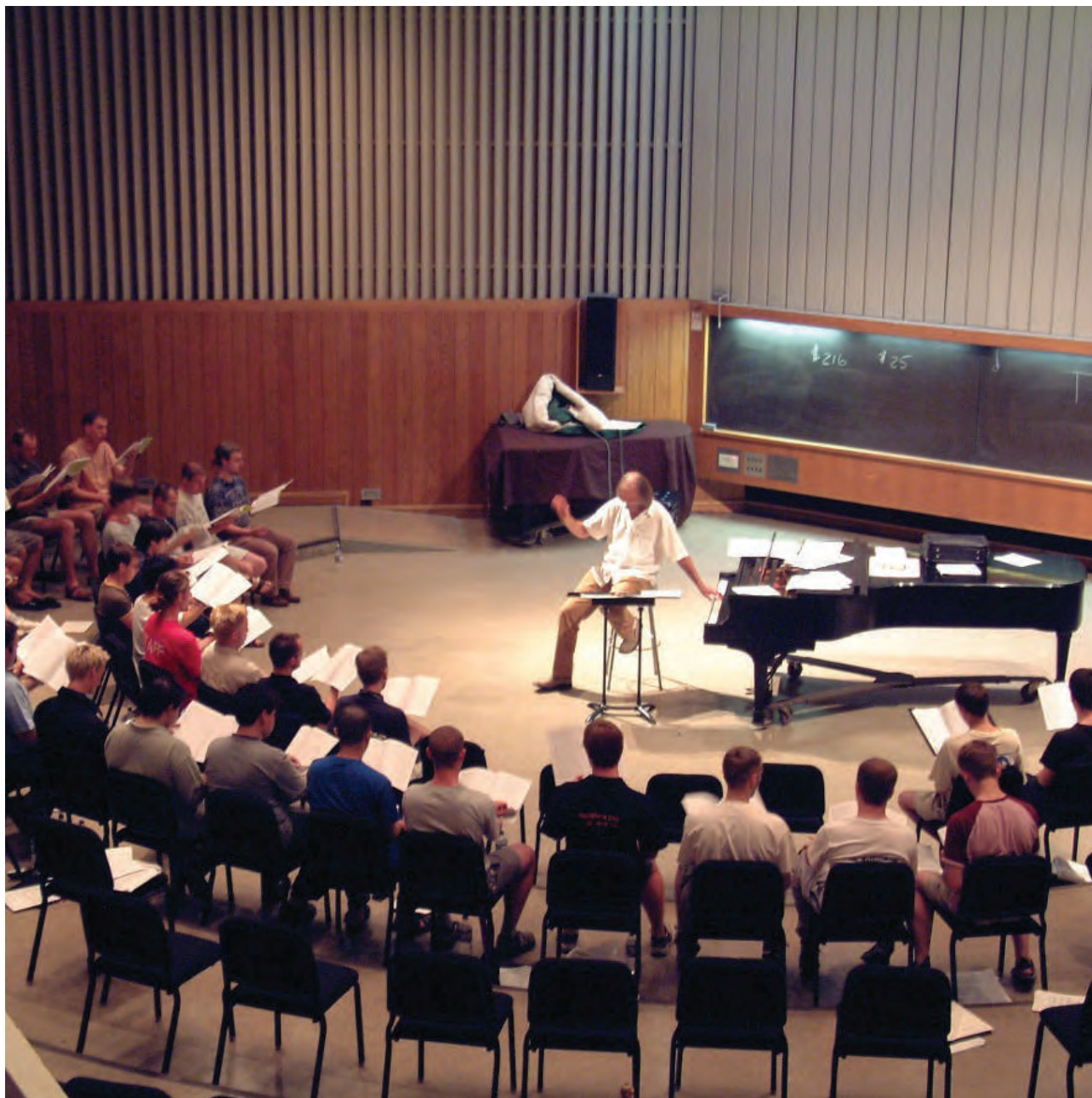
World Youth Choir, Chicago 2002