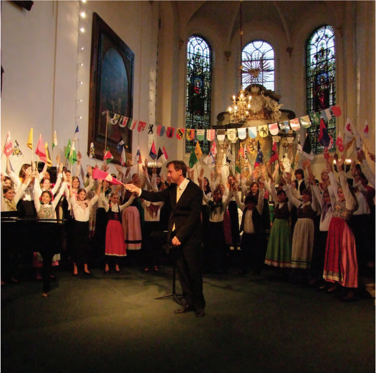
Calicantus Choir, Locarno, Switzerland