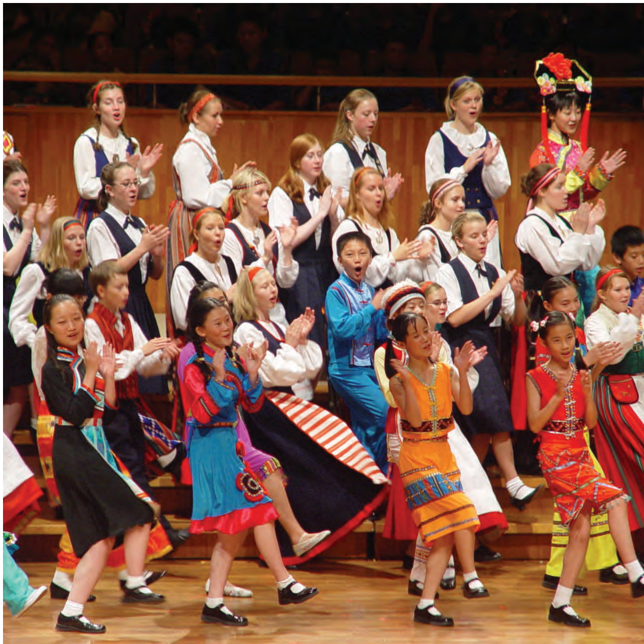
Songbridge in Hong-Kong, 2005