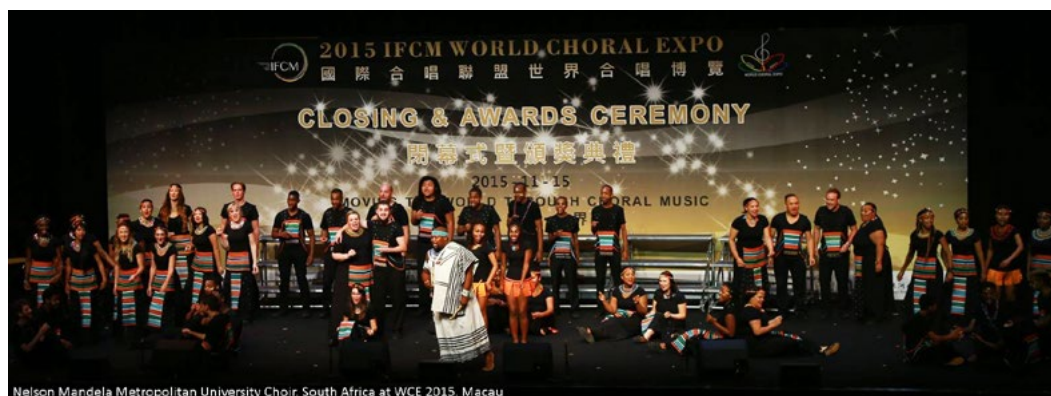
Nelson Mandela Metropolitan University Choir, South Africa at WCE 2015, Macau

See World Choral EXPO 2019 for more information with participating conditions and registration details. Follow the World Choral EXPO Facebook page for up-to-date details. World Choral EXPO 2015 | Highlights from the closing ceremony video