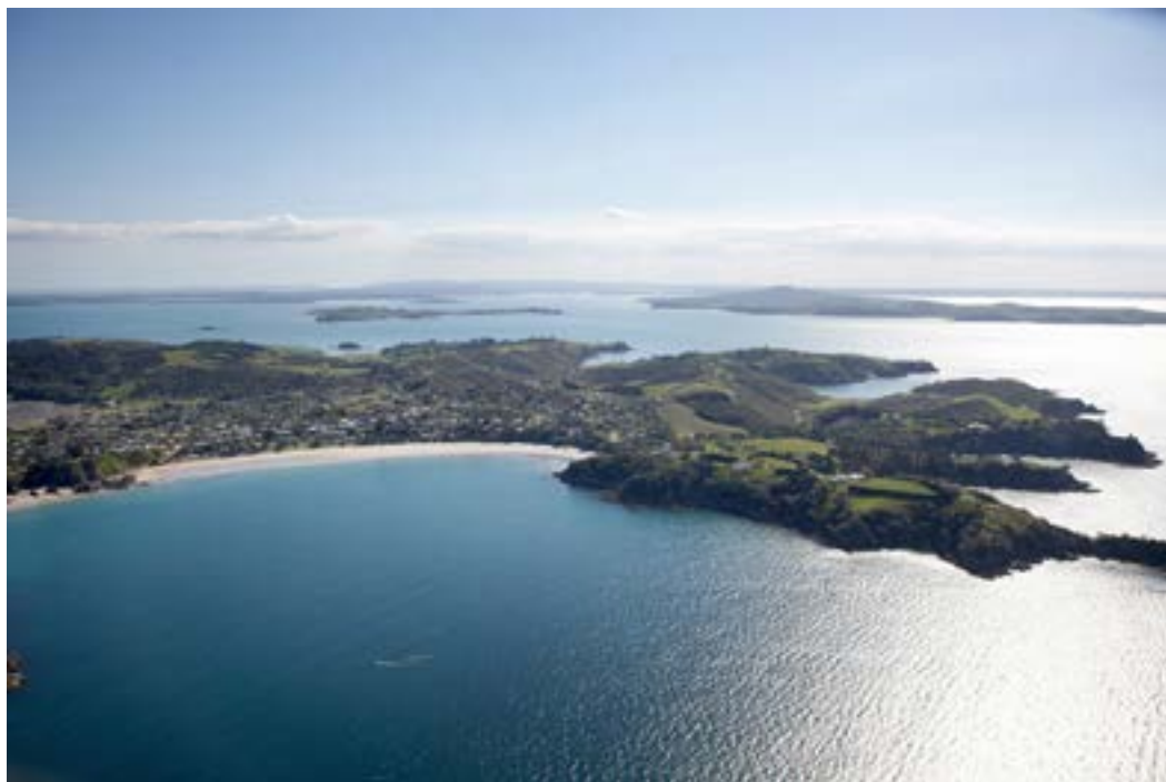
Aerial view of Waiheke Island