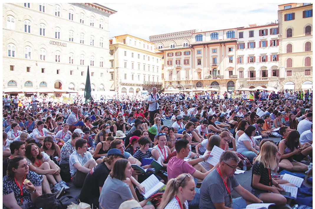
Congress 2022, Florence, Italy, Prayer for Peace © Niels Singer