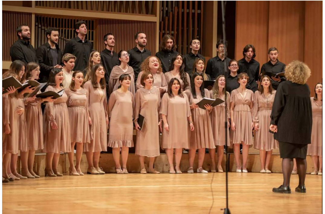
Tutardhela Youth Choir

This activity is organised in the framework of the Choral TIES project co-funded by the European Union.