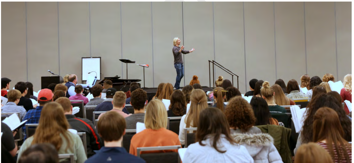
A rehearsal of the ACDA National High School Honor Choir, directed by Eric Whitacre.

A wonderful week of beautiful music soothed the troubled soul. The next ACDA National Conference will be in Kansas City, Missouri, Feb/March, 2019, which will be the Diamond Jubilee of American Choral Directors Association.