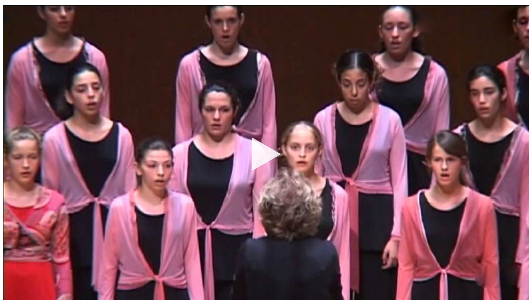
The Efroni Choir, two Songs from the Yemenite tradition