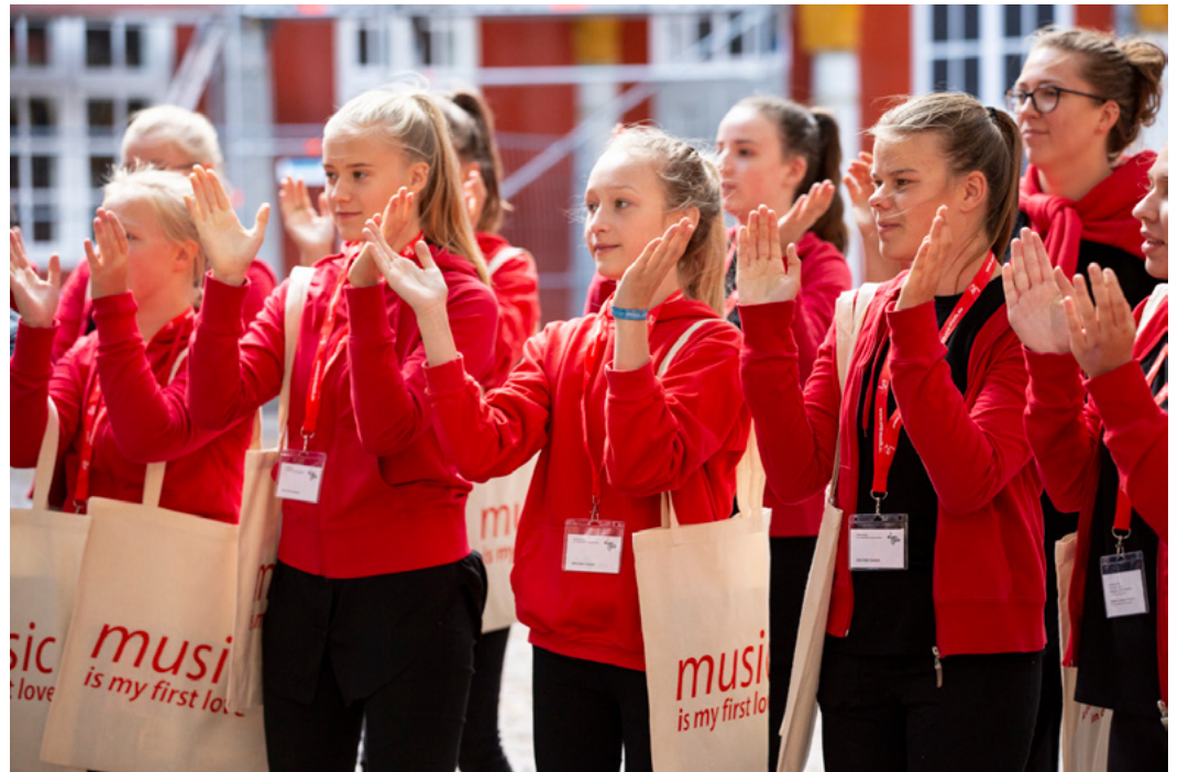
Eurotreff 2019