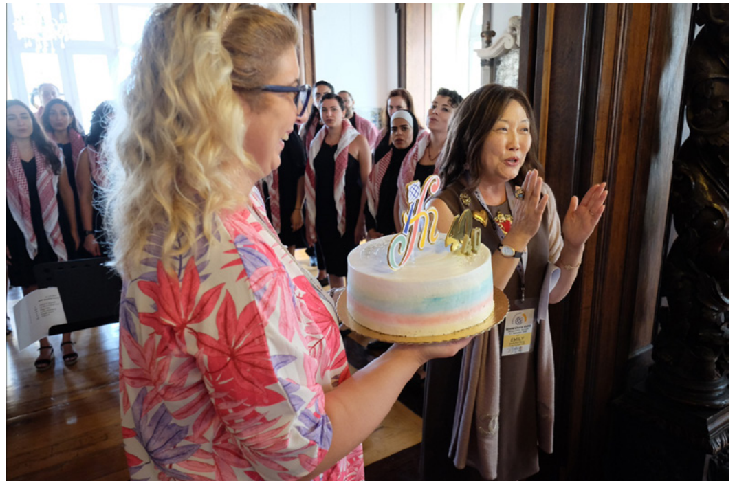
Happy Birthday IFCM!