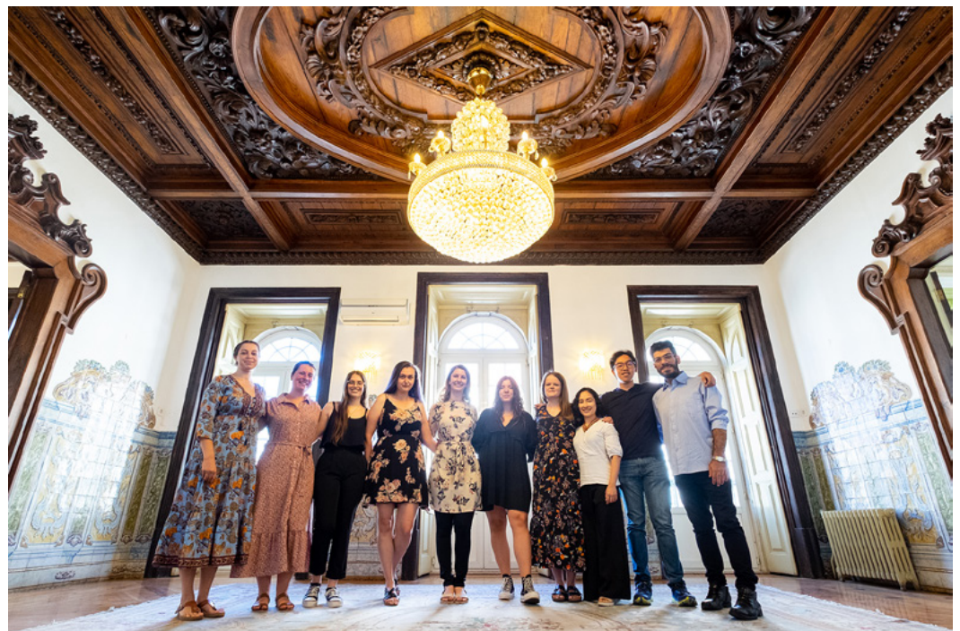
YOUNG participants at the Palacete dos Condes de Monte Real