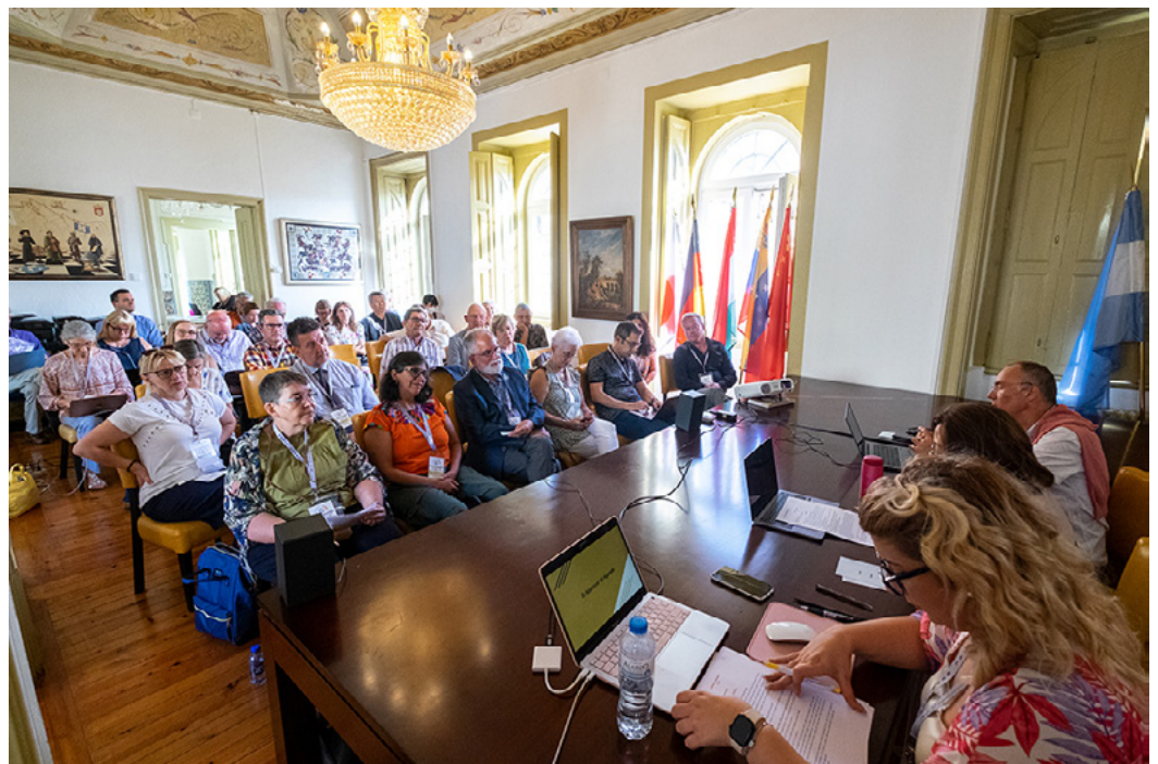
IFCM 2022 General Assembly at the Palacete dos Condes de Monte Real

After a successful online voting which resulted in multiple changes in the IFCM Bylaws and Membership Policy document*, more than 50 IFCM members attended the 2022 General Assembly (4 September 2022) at Palacete dos Condes de Monte Real (Lisbon, Portugal) where they had the possibility to listen to reports on IFCM's projects and activities, ask questions, and make suggestions.