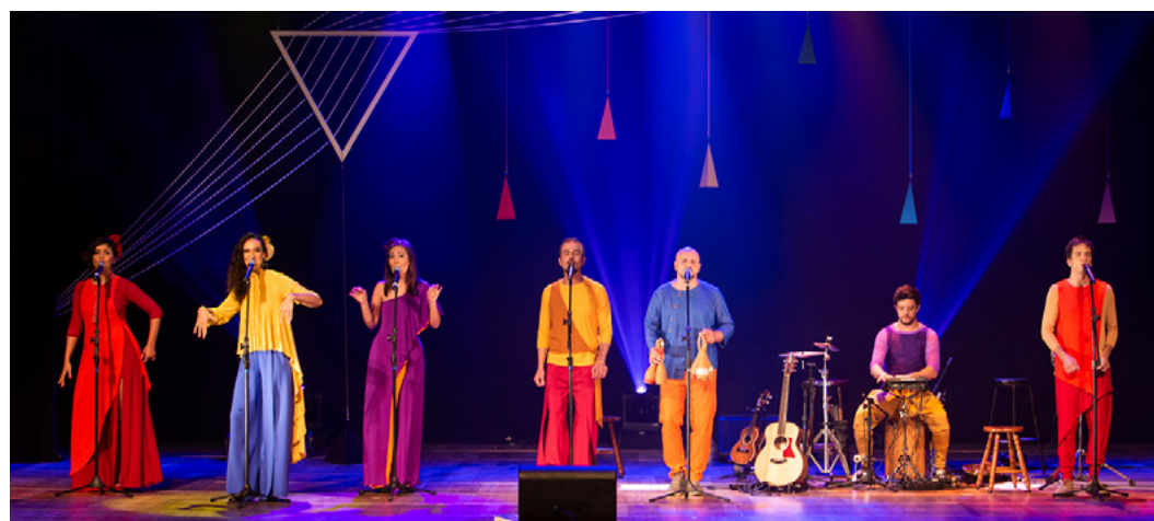
Ordinarius © Ana Rezende