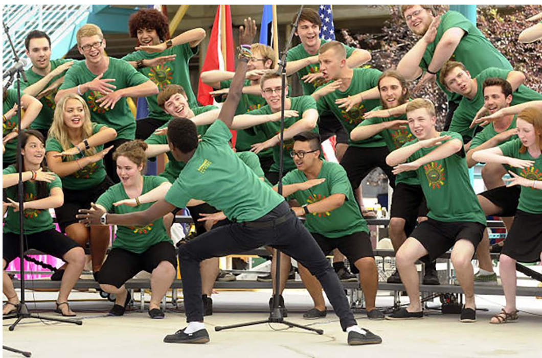
Korora Choir, Canada