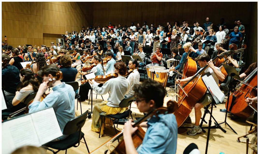
WYC & Bundesjugendorchester

The program was performed in the Tauber Philharmonie Weikersheim, Kloster Eberbach Eltville am Rhein, Concertgebouw Amsterdam, Elbphilharmonie Hamburg and the Opera House Bonn. More update and pictures on the WYC website , Facebook , Instagram and YouTube .