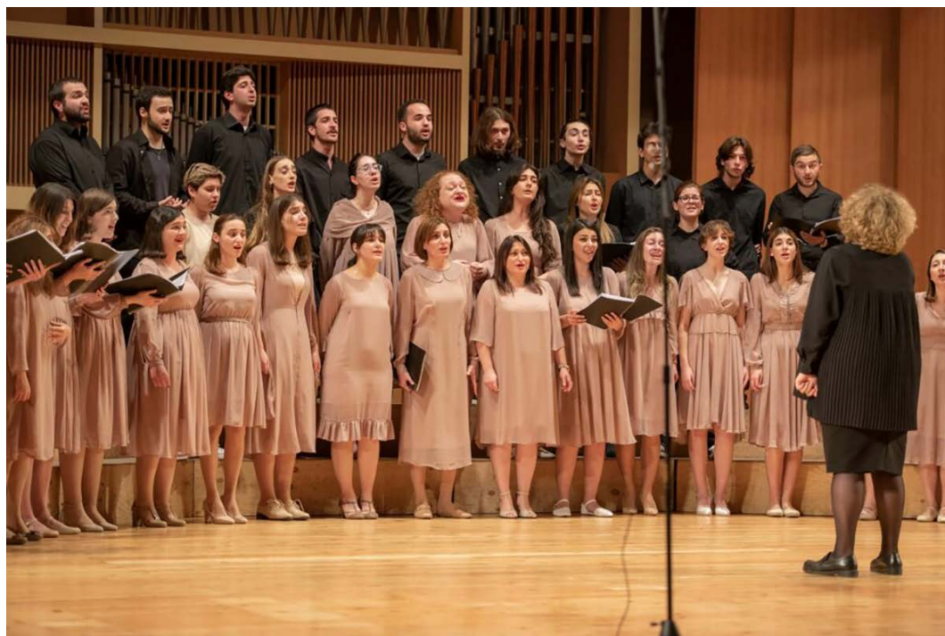
Tutarchela Youth Choir

This activity is organised in the framework of the Choral TIES project co-funded by the European Union.