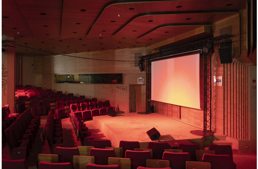
The EFM & EMC Lab sessions will take place at the R2 spaces of Reset (Rue de Ligne 2, Brussels)

The European Forum on Music (EFM) will foster personal exchanges and strengthen relationships between organisations, projects, and individuals. At EFM, you will be able to meet key actors and to participate in a variety of sessions, including keynote speeches, panel discussions, interactive workshops, and networking sessions. Registration opening soon.